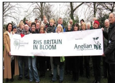
Ipswich Road Ancient Hedgerow