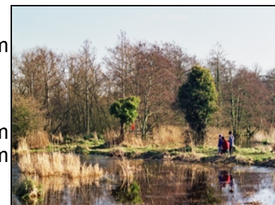
Marston Marsh Nature Reserve