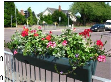
Ipswich Road Barrier Baskets