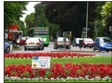
Newmarket Road Roundabout Floral Display