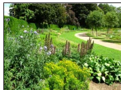
Eaton Park New Wave Perennial Displays