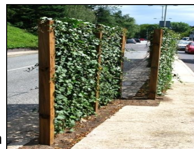
Chapelfield Road Living Ivy Screens