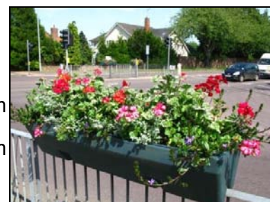
Ipswich Road Barrier Baskets