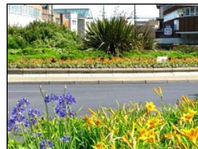
St. Stephens Roundabout Floral Display