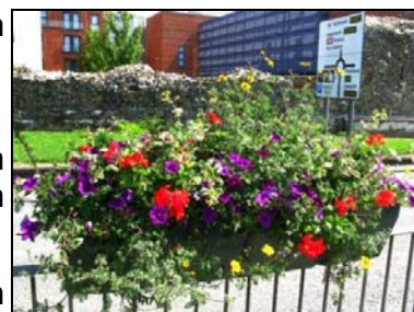
Chapelfield Road Barrier Baskets