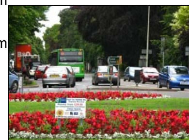
Newmarket Road Roundabout Floral Display